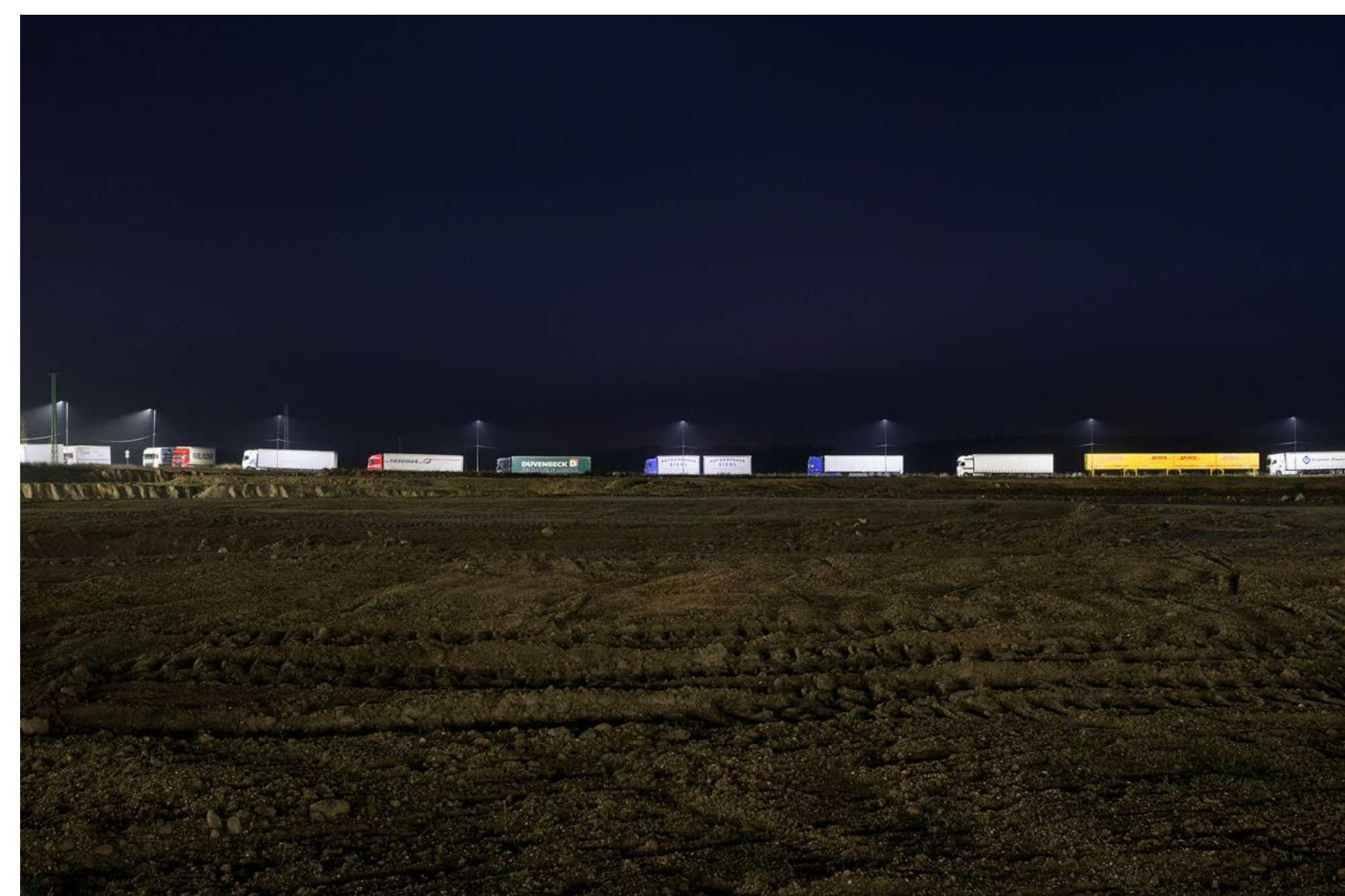
Ima 2 - Warehouse goods logistics (Steel cities)

The mobility of the population and goods causes the view of the planet as one sophisticated logistics network. The construction of infrastructure seems to be a necessary part of the company's development. The necessary construction seems to be a major intervention in the existing urban and landscape environment, making it a strong topic for an active approach.