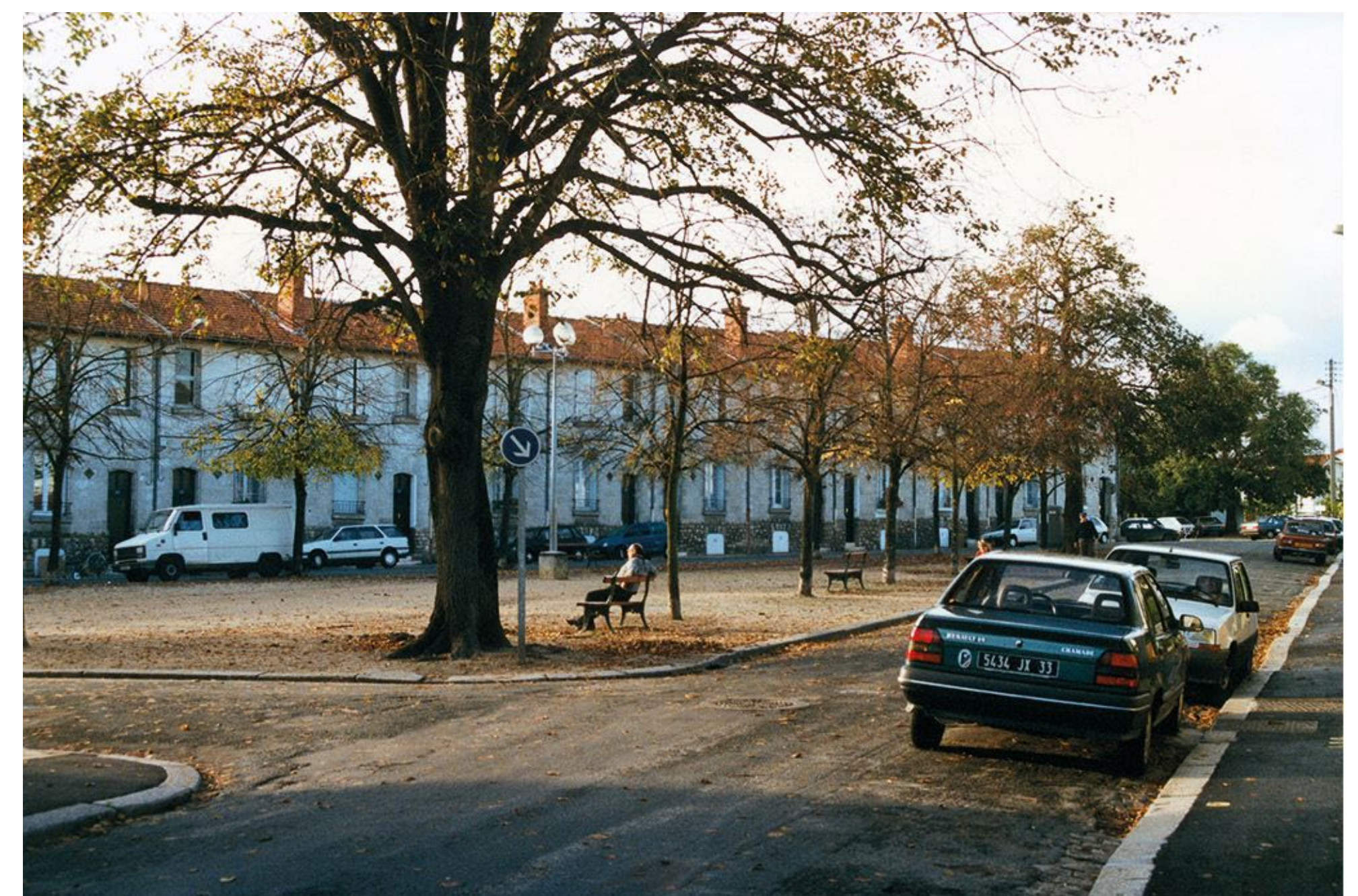
Img. 3 - Place Léon Aucoc, Bordeaux (Lacaton Vassal)