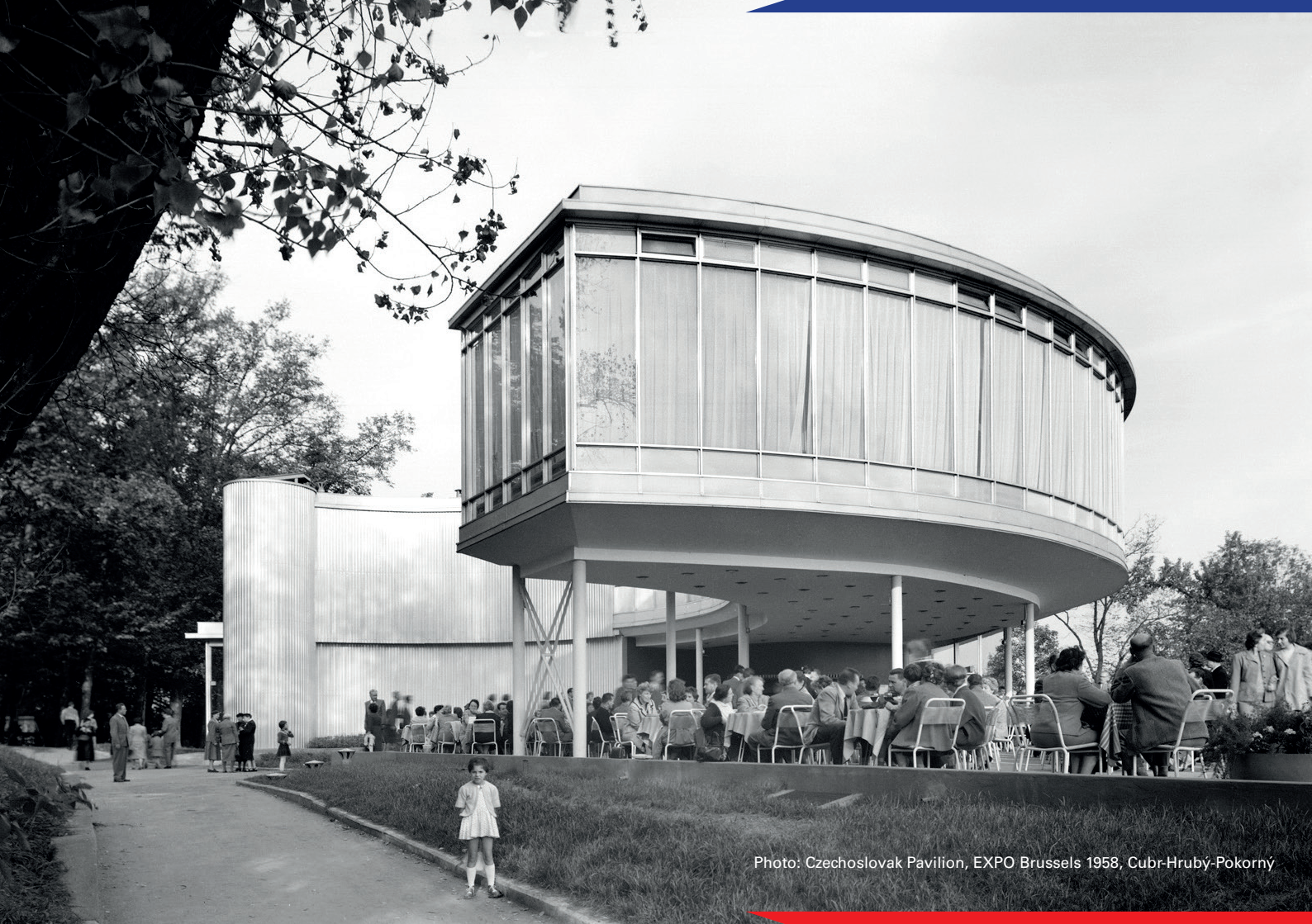
Photo: Czechoslovak Pavilion, EXPO Brussels 1958, Cubr-Hruby-Pokorný